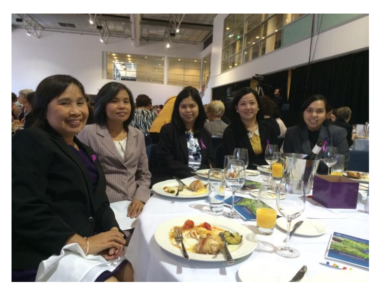
The Philippine Embassy ladies joined women all over the world in marking International Women's Day (IWD) by attending the IWD lunch organized by UN Women Australia at the National Convention Centre on 5 March 2015.

Over 1,200 people attended the IWD event.